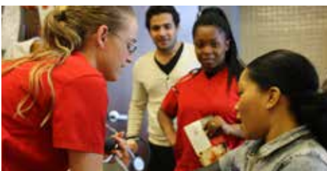
Occupational Health students put newly acquired skills into practice by offering blood pressure screenings.