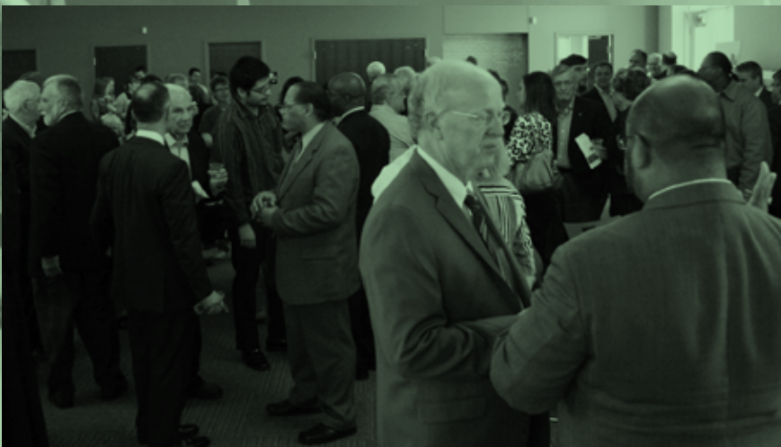
Board members and guests mingle in the new 3,196 square-foot event space

The celebration continued as guests streamed into the new 3,196 square-foot facility that serves as a venue for campus and community meetings as well as special events.