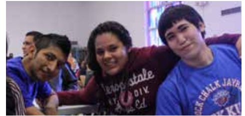
Celebrating Pi Day (an event organized by the Math faculty)...with pie, of course!