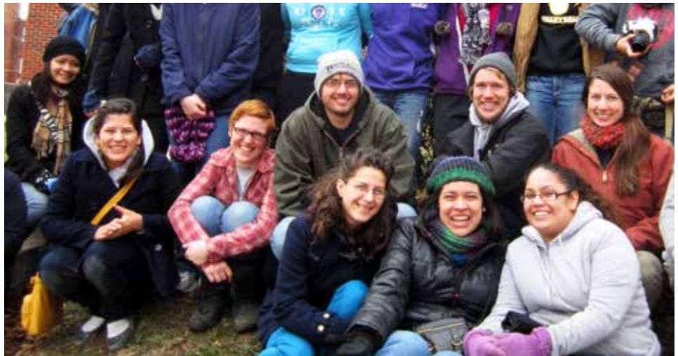
Students from Donnelly College and Avila University huddled together on a cold January day after working together on an outdoor project in observance of Martin Luther King, Jr. Day of Service.