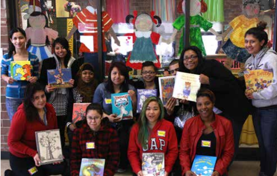
Students from Donnelly's Preparatory Education Program read to students at M.E. Pearson Elementary in Kansas City, Kansas as a part of a service learning assignment that emphasized the importance of literacy among children.