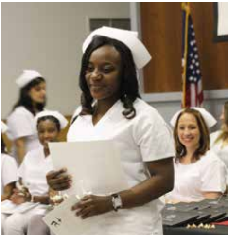
Proud new DC Practical Nursing program graduates receive their pins.