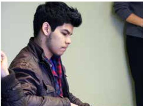
ESL student focuses during his exam.