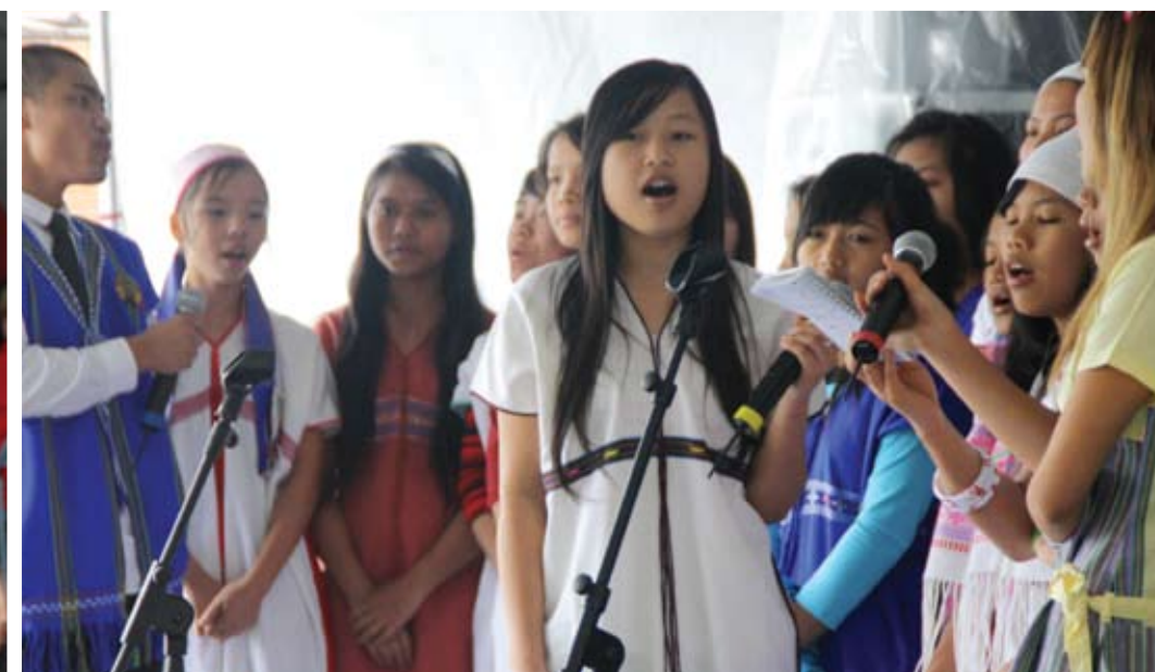
caption caption caption