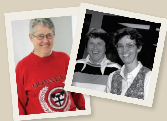
Captions Captions captions