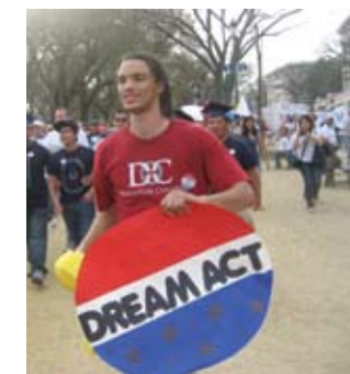
Captions Captions captions