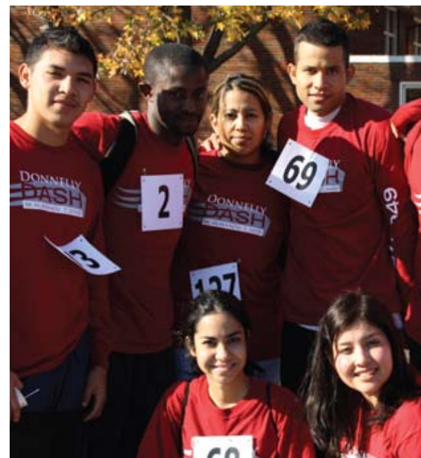
Top: Participants begin their 5K excursion through the neighborhoods surrounding the College. Above: Donnelly students gather following the 5K to listen to music and enjoy a hot breakfast.

Send the vendor name and contact information to Laura Bryon at lbryon@donnelly.edu . Your suggestions are much appreciated!