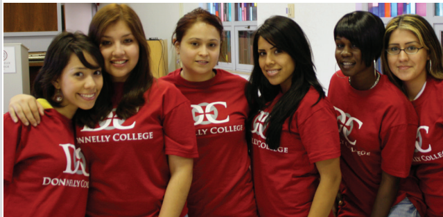
Members of Donnelly's women's soccer club proudly display t-shirts showcasing the new informal logo.

The long-awaited logos took more than a year to complete as the College's Development Committee worked meticulously to find a look that encompasses Donnelly's mission, values and professionalism.